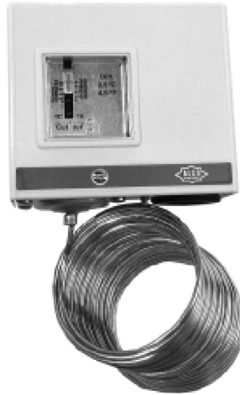
LLC-307 model shown above