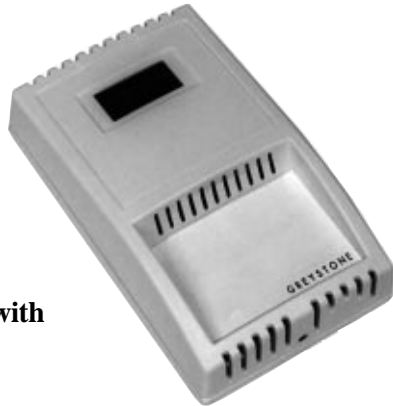
RH100A shown with optional display.